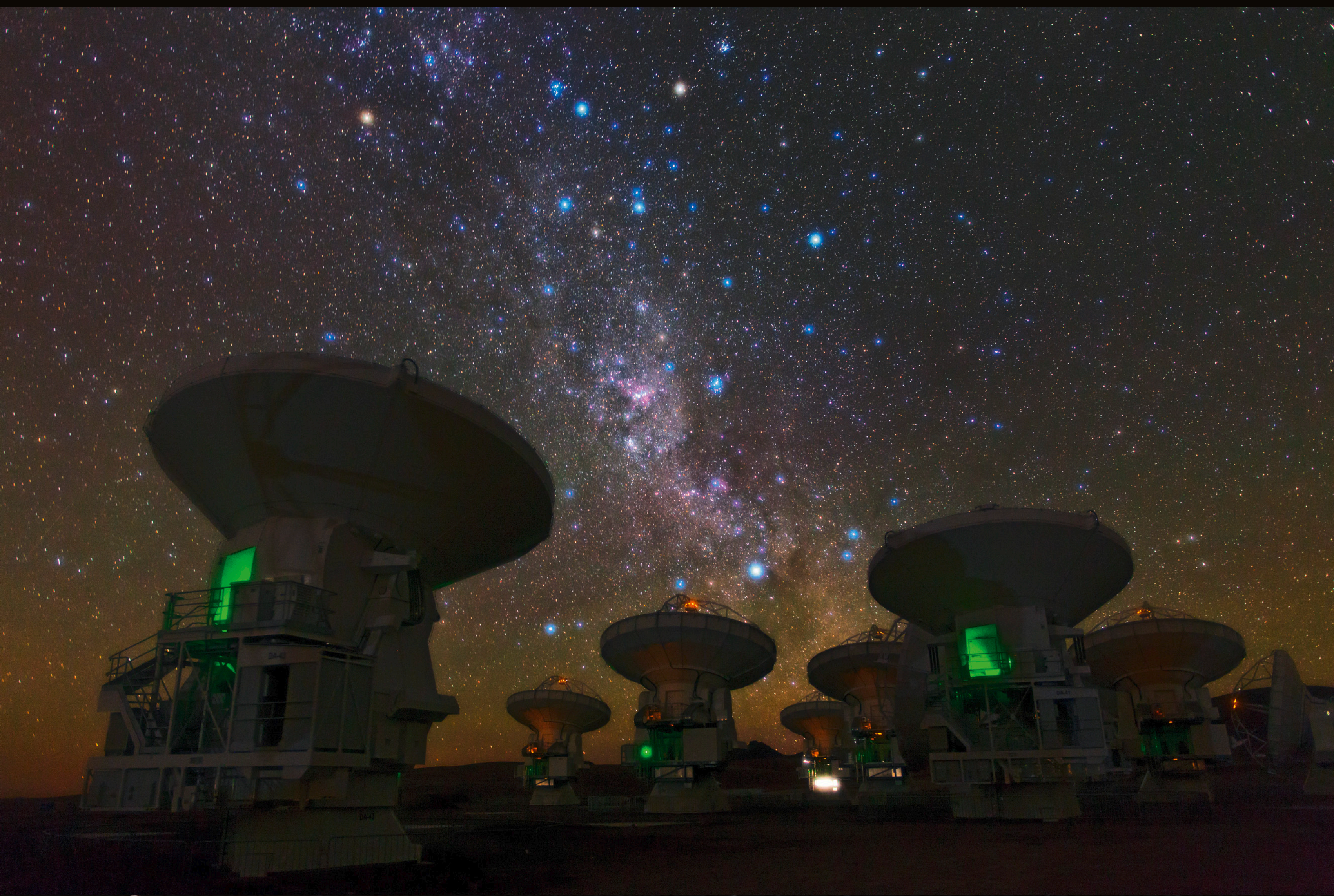
ALMA antennas at night on Chajnantor.