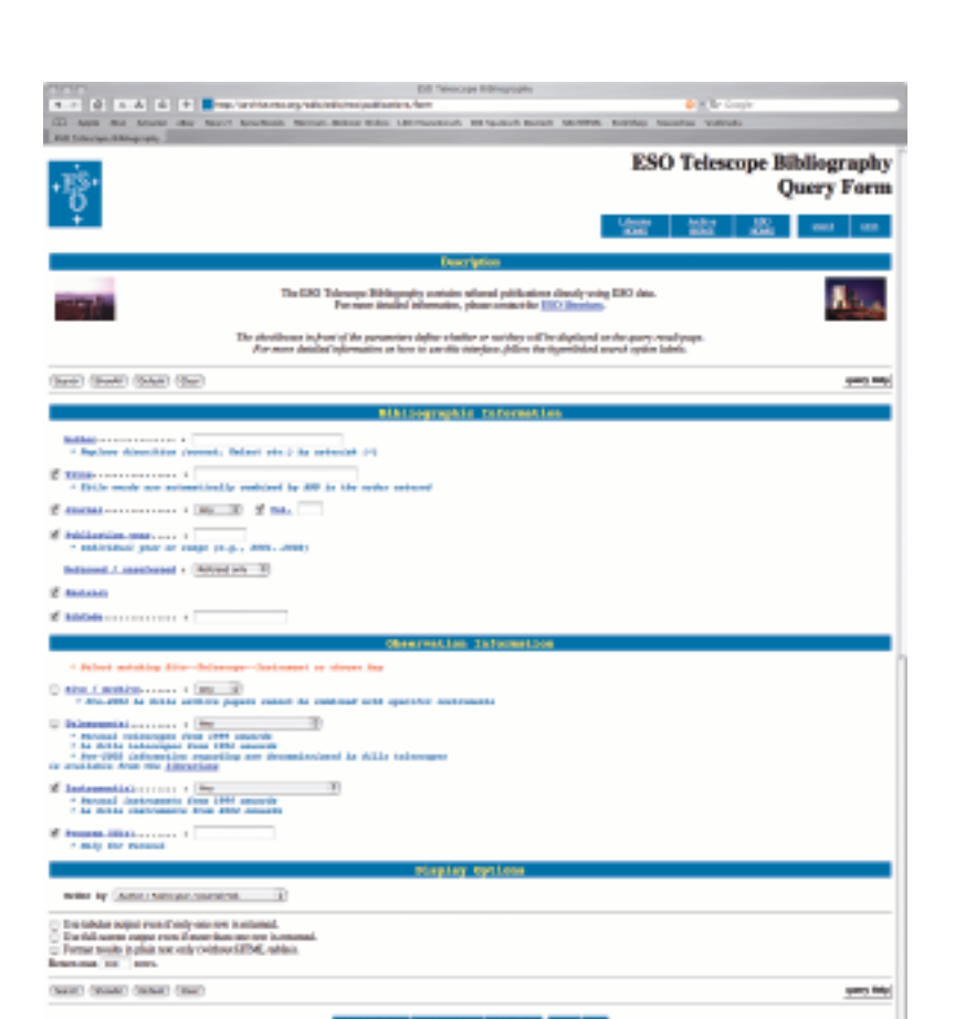
Figure 1 (above): ESO telescope bibliography web interface at http://www.eso.org/