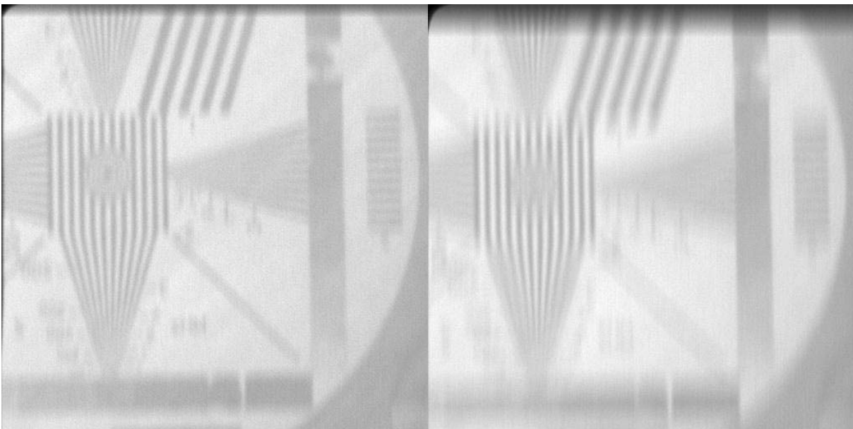
Figure 2&4 - Exposure Time = 200ms (Left) & 500ms (Right)