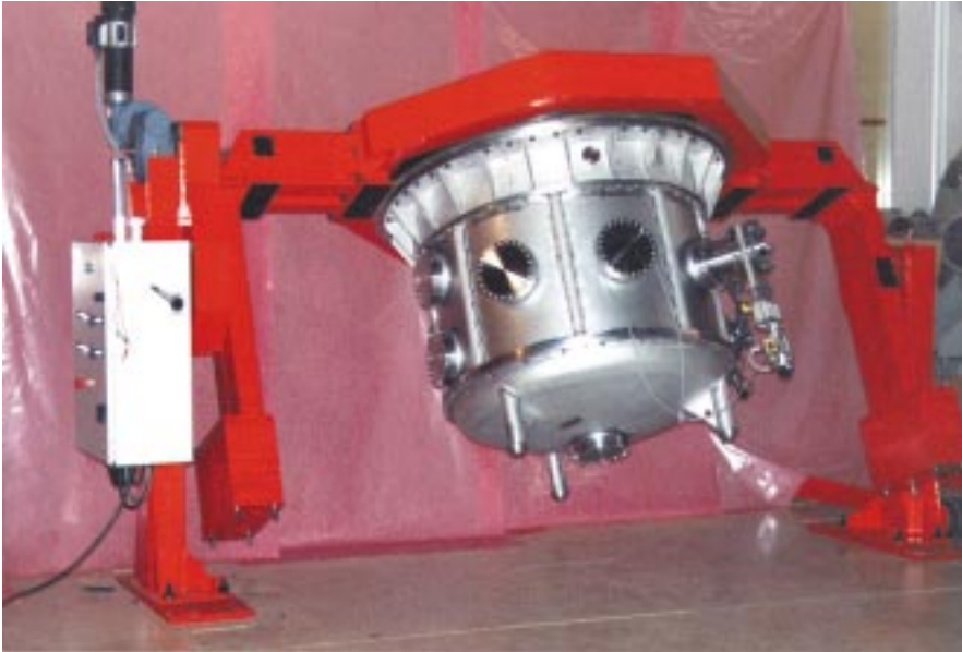
Figure 3: Test equipments of VISIR. One can see the test cryostat mounted on its integration support, which allows to simulate the telescope position and to measure the mechanical flexure.

is a concave aspherical collimator mirror, which provides an 18-mm cold stop pupil in parallel light (as usual for infrared instruments, the pupil of the telescope is imaged on a cold stop mask to avoid straylight). The second mirror is just a folding flat mirror which eases the mechanical implementation, especially of the two filter wheels immediately behind the cold stop. The last three mirrors form a Three Mirror Anastigmat (TMA) configuration, similar to the TMA systems used in the VISIR spectrometer. They ensure the re-imaging of the field onto the detector. The three magnifications required for the imager are obtained by three sets of TMA mirrors mounted on a wheel. The optical calculations have shown that the image quality of the system is excellent (well below the telescope diffraction limit).