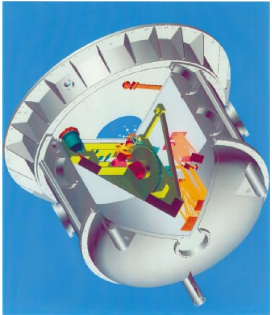
Figure 2: Drawing of the VISIR enclosure, "opened" to show a schematic drawing of the imager mechanical structure. The cryostat is a cylinder of length 0.7 m and diameter 1.2 m. The weight of the cryostat and of the enclosed optical bench is 1 ton. When we consider the total weight of VISIR (cryostat, pumps, cable wrap, electronics boxes ...), we are only 10% below the limit of the VLT unit (2.5 tons).

The development of these arrays has taken much more time than expected. Even if the first arrays now exist, optimisations are still needed, for example in terms of noise. Our aim is to be able to test these arrays at Saclay, in the operating conditions of VISIR. We are setting agreements with each of the two suppliers to this purpose. Those BIB (Blocked Impurity Band) Si:As detectors are con-